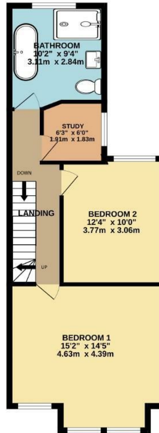
1ST FLOOR 457 sq.ft. (40.3 sq.m.) approx.